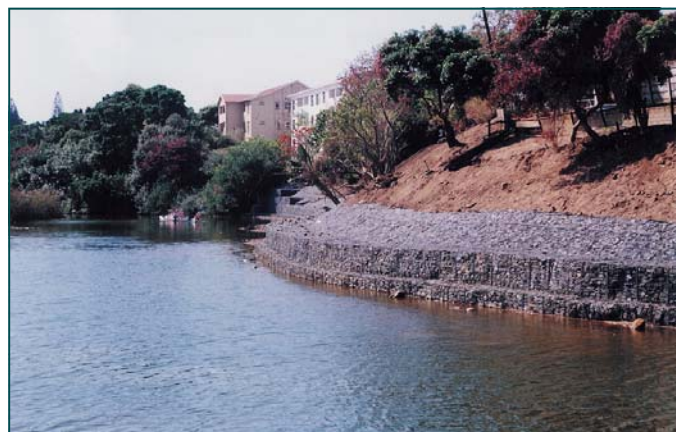
Immediately after construction