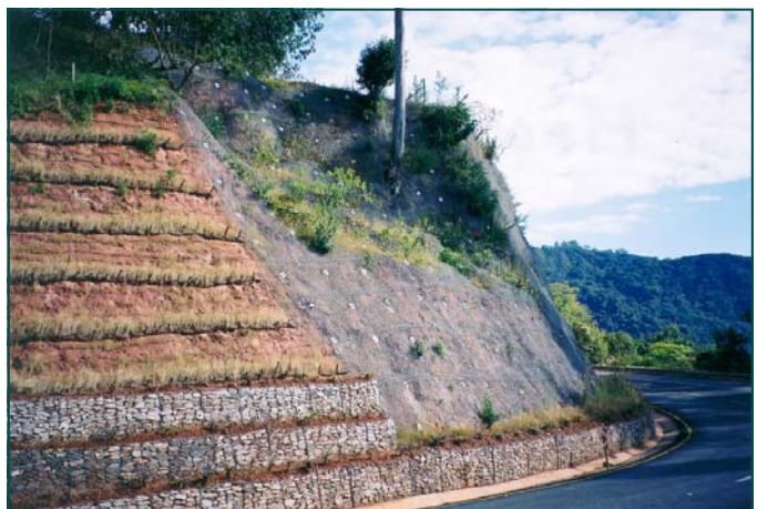
After construction Date: May 2002