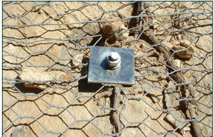
Rockfall netting/rock dowel connection detail Date: June 2001