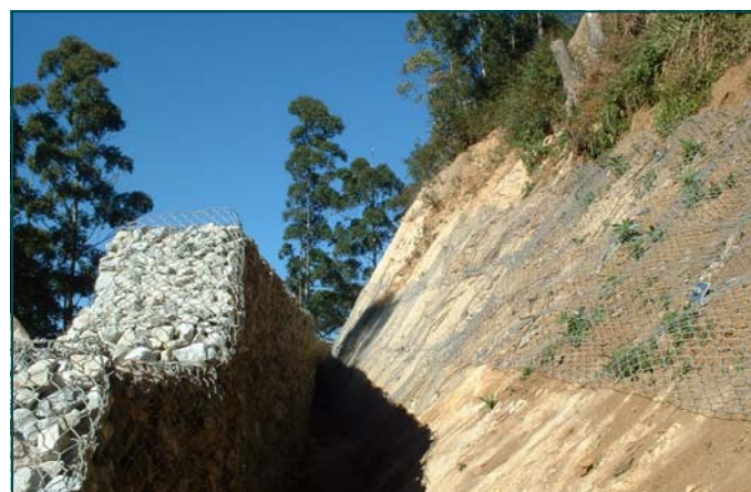
View behind gabion wall barrier