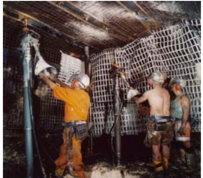
Underground mining operation shows miners installing prop systems whilst PARARIB provides protection from loose debris.

PARARIB™ can be supplied in a range of tensile strengths (in both length and across direction) to suit individual requirements. Various roll widths from 1.275 metres (4' 2") up to a maximum single width of 4.5 metres (14' 9") can be supplied. Roll lengths can also be varied to suit particular customer requirements.